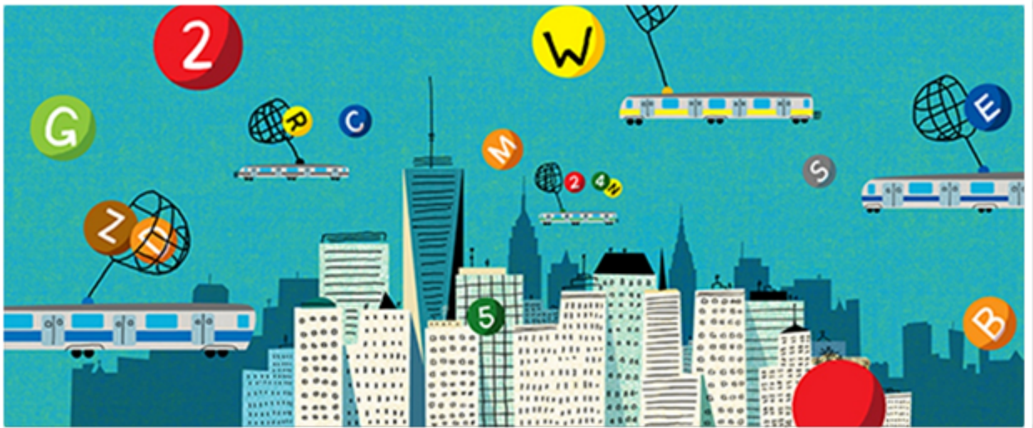
Art Card and detail by James Yang, Metropolitan Transportation Authority